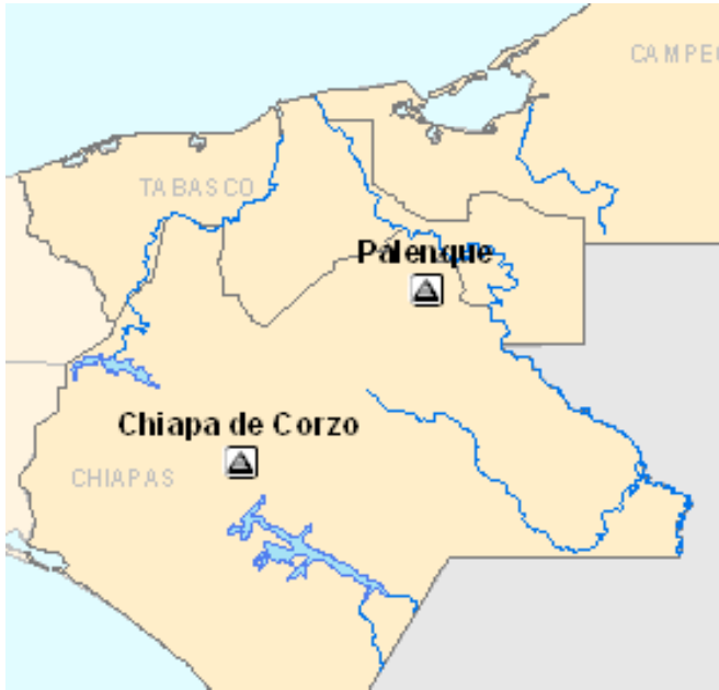
No River names.