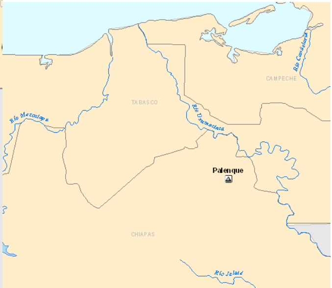
When zoomed in Rivers have their name displayed. The name also bends to match the rivers bends.