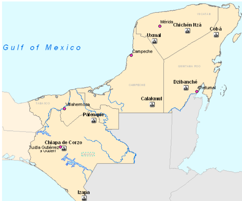
We see that the names of the regions have been moved for better visibility. This was done by using convert labels to annotations so they could be manually moved to where visibility would be better.